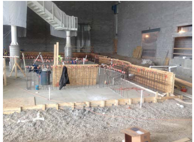
4. Rec. Pool: Walls are getting formed up for concrete.