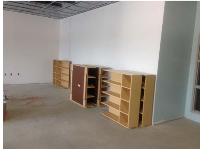
2. Childcare: Cabinets are delivered and ready for install.