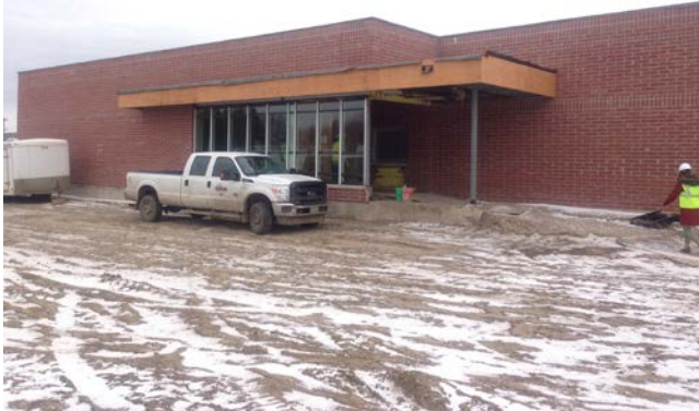
1. Childcare: Window installation at commons.