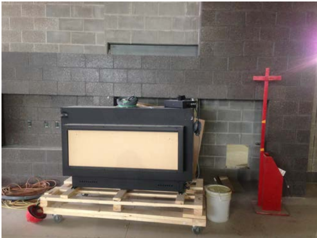
3. Lobby: Fireplace installation is underway.