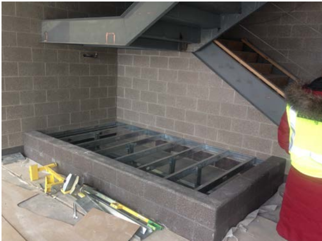
5. East Stair: Seating area under stair.